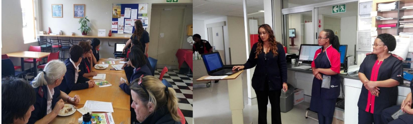
Our intern giving a talk to the Unit managers and the wards about Pharmacy week